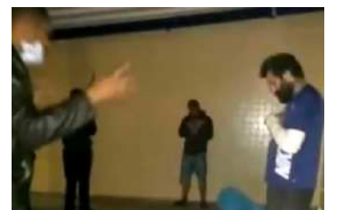
A Pastor from the Universal Church (UBB) did a prayer where I used to sleep on the street.

But the worst part was the emptiness I felt every single day. I woke up just waiting for the day I would die.