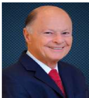
Bishop Edir Macedo

You are not alone in this fight. Thousands around the world have found hope and transformation through faith, proving that the Chain of Prayer can truly make a difference. You can be the next success story. You can beat depression.