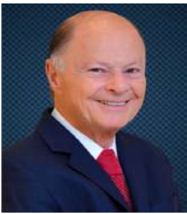
Bishop Edir Macedo

Call 1.888.332.4141 Text 1.888.312.4141 For more information SEE PAGE 12 FOR LOCATIONS