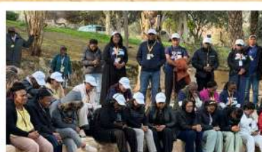
Moment of prayer