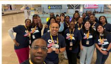
Welcome to Israel

An unforgettable pilgrimage that touched hearts and transformed spirits. This was more than a trip. It was a life changing experience. Among the highlighted places were the Jordan River, Mount Hermon, Qumran, the Sea of Galilee, Gethsemane, and Jesus' tomb.