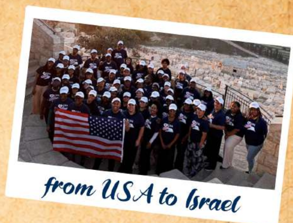
from USA to Israel

An unforgettable pilgrimage that touched hearts and transformed spirits. This was more than a trip. It was a life changing experience. Among the highlighted places were the Jordan River, Mount Hermon, Qumran, the Sea of Galilee, Gethsemane, and Jesus' tomb.