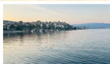
Sea of Galilee