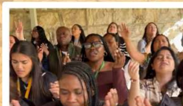
Jesus tomb Holy Communion

The Qumran desert was another meaningful stop. It is one of the places where the Word of God began to be recorded. The Scriptures were hidden in caves, and although lives were sacrificed there, the Word of God was preserved.