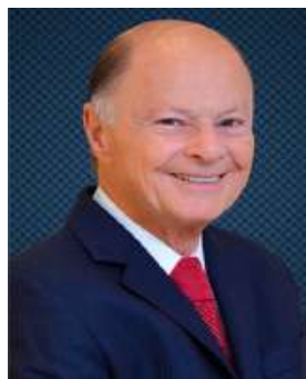
Bishop Edir Macedo