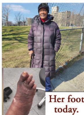
Her foot today.