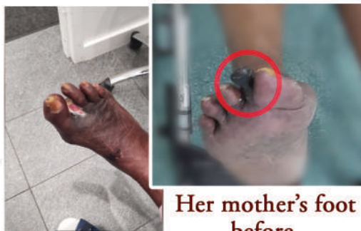
Her mother's foot before.

My mother's toes were affected by gangrene, and the doctors said they needed to amputate her leg because of poor circulation.