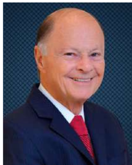
Bishop Edir Macedo

For more information SEE PAGE 12 FOR LOCATIONS